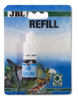
JBL pH Test 3.0-10.0 Quick test to determine the acidity