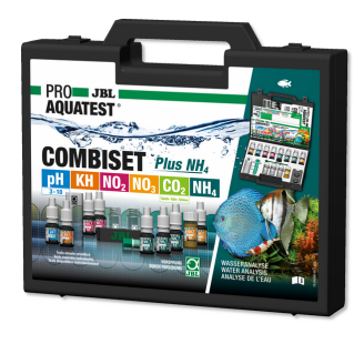
JBL PROAQUATEST COMBISET Plus NH4

Test case with most important water tests + iron test