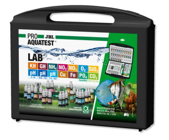
JBL PROAQUATEST LAB

Test case with most important water tests + NH4 test