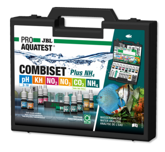
JBL PROAQUATEST COMBISET Plus NH4

Test case with most important water tests + iron test