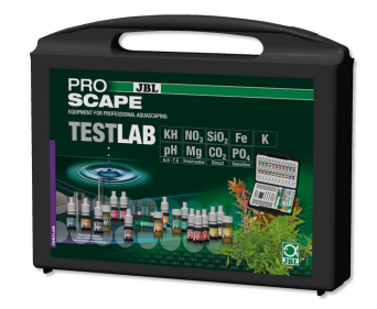
JBL PROAQUATEST LAB PROSCAPE Test case for water analysis in plant aquariums