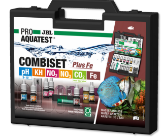
JBL PROAQUATEST COMBISET Plus Fe Test case with most important water tests + iron test