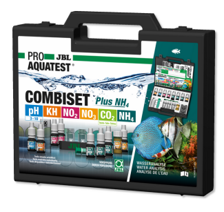
JBL PROAQUATEST COMBISET Plus NH4

Test case with most important water tests + iron test