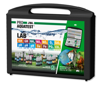
JBL PROAQUATEST LAB

Test case with most important water tests + NH4 test