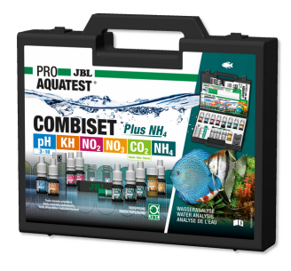
JBL PROAQUATEST COMBISET Plus NH4

Test case with most important water tests + iron test