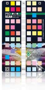
JBL ProScan ColorCard