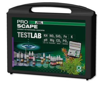
JBL PROAQUATEST LAB PROSCAPE

Test case with 13 water tests for freshwater analysis