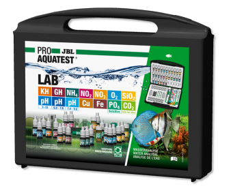
JBL PROAQUATEST LAB

Test case with most important water tests + NH4 test