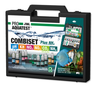
JBL PROAQUATEST COMBISET Plus NH4

Test case with most important water tests + iron test