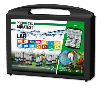
JBL PROAQUATEST LAB

Test case with most important water tests + NH4 test