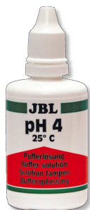
JBL Buffer Solution pH 4.0 Calibration solution with pH 4.0 for pH electrodes