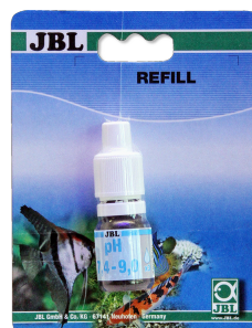
JBL pH Test 7.4-9.0 pH test in aquariums and ponds in the range 7.4-9.0