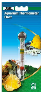
JBL Aquarium Thermometer Float Aquarium thermometer