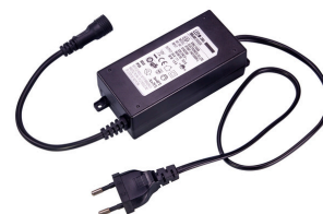
JBL LED SOLAR Driver