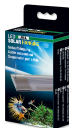
JBL LED SOLAR Hanging Rope hanging fixture for JBL LED SOLAR lights