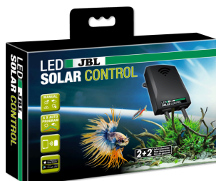
JBL LED SOLAR CONTROL Control unit for JBL LED SOLAR lights