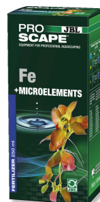
JBL PROSCAPE Fe + MICROELEMENTS Basic plant fertiliser for aquascaping