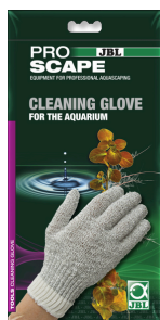
JBL PROSCAPE CLEANING GLOVE Aquarium cleaning glove