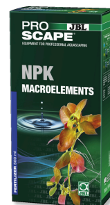
JBL PROSCAPE NPK MACROELEMENTS 3-component plant fertiliser for aquascaping