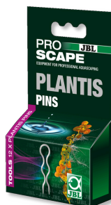
JBL PROSCAPE PLANTIS PINS Plant pegs for the anchoring of aquarium plants