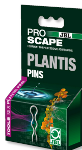
JBL PROSCAPE PLANTIS PINS Plant pegs for the anchoring of aquarium plants