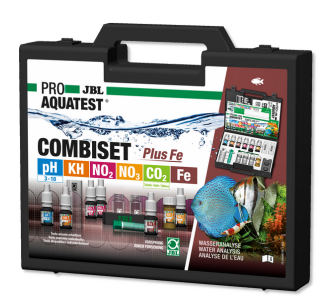
JBL PROAQUATEST COMBISET Plus Fe

Test case with most important water tests + iron test