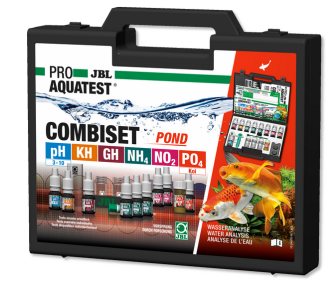
JBL PROAQUATEST COMBISET POND

Test case with 13 water tests for freshwater analysis