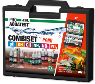
JBL PROAQUATEST COMBISET POND Test case for water analyses in