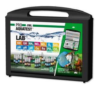
JBL PROAQUATEST LAB Test case with 13 water tests for freshwater analysis

Test case with most important water tests + iron test