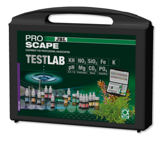
JBL PROAQUATEST LAB PROSCAPE Tost case for water analysis in

Test case for water analysis in plant aquariums