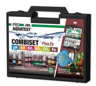
JBL PROAQUATEST COMBISET Plus Fe Test case with most important water tests + iron test