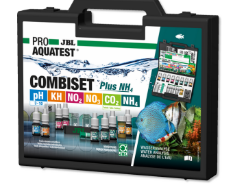
JBL PROAQUATEST COMBISET Plus NH4 Test case with most important water tests + NH4 test