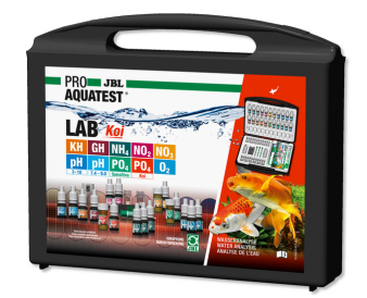
JBL PROAQUATEST LAB Koi Professional test case for koi and garden ponds