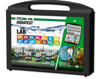
JBL PROAQUATEST LAB Test case with 13 water tests for freshwater analysis