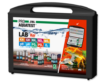
JBL PROAQUATEST LAB Koi Professional test case for koi and garden ponds