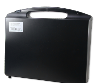
JBL Testlab empty + inserts