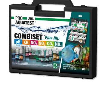
JBL PROAQUATEST COMBISET Plus NH4

Test case with most important water tests + NH4 test