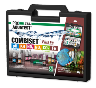
JBL PROAQUATEST COMBISET Plus Fe Test case with most important water tests + iron test