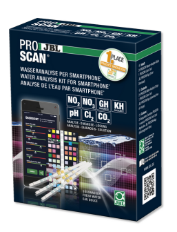
JBL PROSCAN Water test with analysis via smartphone