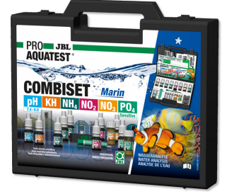
JBL PROAQUATEST COMBISET Marin

Test case with most important water tests + NH4 test