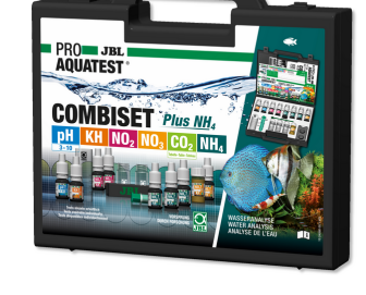
JBL PROAQUATEST COMBISET Plus NH4 Test case with most important water tests + NH4 test