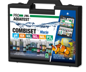
JBL PROAQUATEST COMBISET Marin

Test case for water analyses in marine aquariums