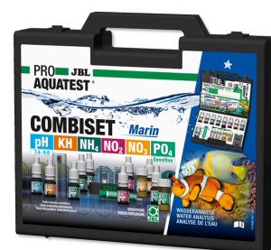
JBL PROAQUATEST COMBISET Marin Test case for water analyses in marine aquariums