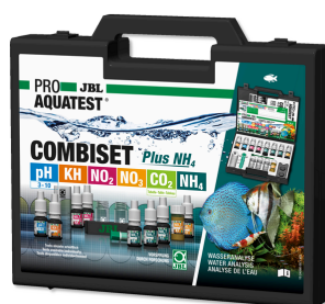
JBL PROAQUATEST COMBISET Plus NH 4 Test case with most important water tests + NH 4 test