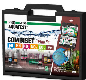
JBL PROAQUATEST COMBISET Plus Fe Test case with most important water tests + iron test