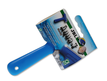
JBL Aqua-T Handy Glass pane cleaner with stainless steel blade