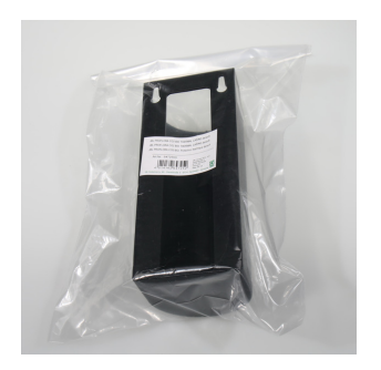
JBL PF CO2 BIO THERMAL CASING