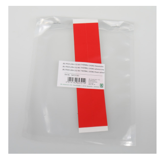
JBL PF CO2 BIO THERMAL CASING adhesive tape