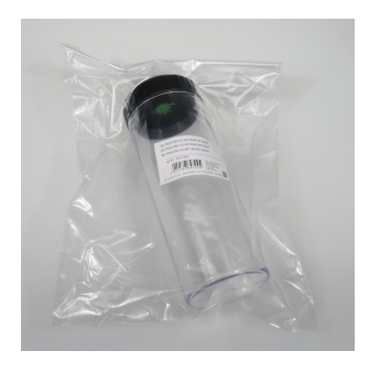
JBL PF CO2 BIO REAKTOR