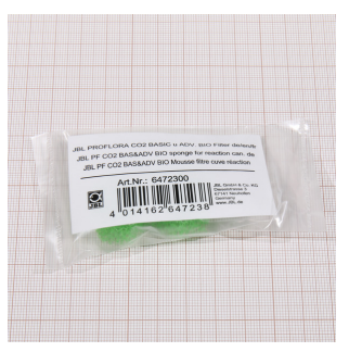
JBL PF CO2 BIO REAKTOR filter