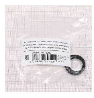
JBL PF CO2 BIO REAKTOR seal