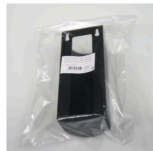
JBL PF CO2 BIO THERMAL CASING