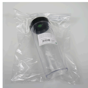
JBL PF CO2 BIO REAKTOR