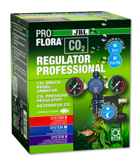
JBL PROFLORA CO2 REGULATOR PROFESSIONAL

Pressure regulator with 2 displays & valve for CO2