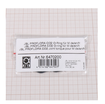
JBL PROFLORA CO2 Oring for m