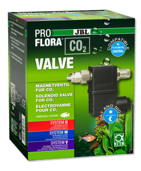
JBL PROFLORA CO2 VALVE

CO2 solenoid valve for regulated CO2 addition