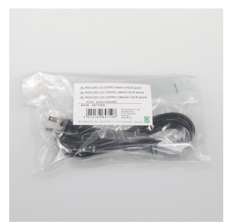
JBL PF CO2 CONTROL cable for VALVE