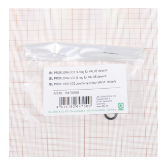
JBL PF CO2 O-ring for VALVE