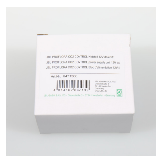
JBL PF CO2 CONTROL power supply unit 12V