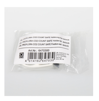
JBL PF CO2 COUNT SAFE holder set