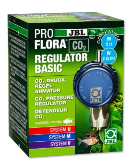
JBL PROFLORA CO2 REGULATOR BASIC

Glass CO2 diffuser for freshwater tanks from 40-300 l