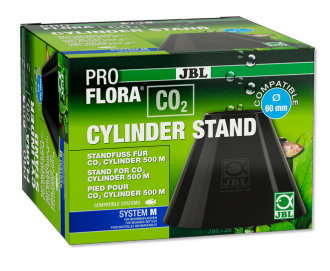
JBL PROFLORA CO2 CYLINDER STAND

Wall mount for CO2 cylinders with safety bracket