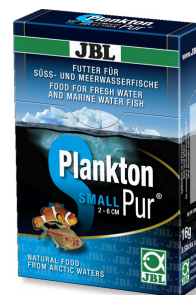
JBL PlanktonPur SMALL Treats for small aquarium fish