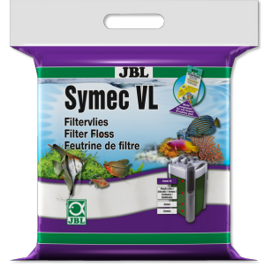
JBL Symec VL Filter wool fleece to remove water cloudiness