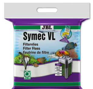
JBL Symec VL Filter wool fleece to remove water cloudiness