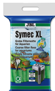
JBL Symec XL Coarse filter wool to remove all types of water cloudiness