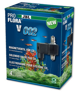
JBL PROFLORA v002 Noiseless solenoid valve