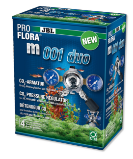
JBL PROFLORA m001 duo Fitting to reduce pressure for 2 CO2 diffusers