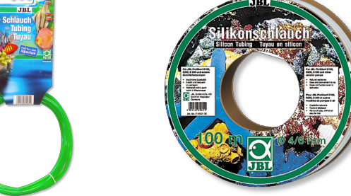
JBL silicone hose 4/6 mm on reel Semi-transparent air hose,