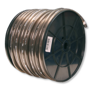
JBL Aquarium tubing

GREY on reel Pre-cut grey hose for aquariums & ponds Grey-transparent hose wound on a reel