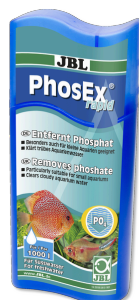
JBL PhosEx rapid Phosphate remover for freshwater aquariums