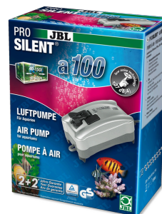
JBL PROSILENT a100 Air pump for fresh and saltwater aquariums