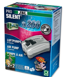
JBL PROSILENT a200 Air pump for fresh and saltwater aquariums