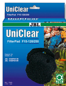
JBL FilterPad F15 Coarse foam pad for aquarium filter CristalProfi