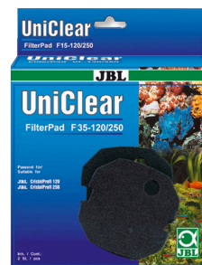
JBL FilterPad F35 Fine foam pad for aquarium filter CristalProfi