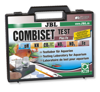
JBL Test Combi Set plus Fe

Test case with most important water tests + iron test