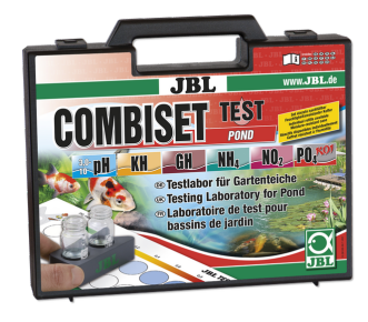
JBL Test Combi Set Pond

The most important water tests for garden ponds