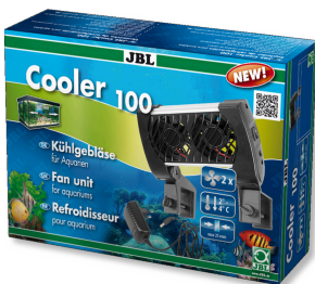
JBL Cooler 100 Cooling fan for fresh- and saltwater aquariums