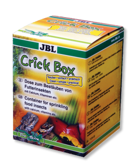
JBL CrickBox Shaker box to sprinkle powder on feeder insects