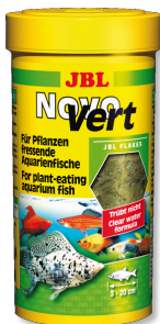
JBL NovoVert Main food flakes for plant-eating fish