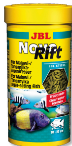
JBL NovoRift Main food sticks for grazing cichlids