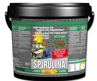
JBL Spirulina Premium main food for algae-eating aquarium fish