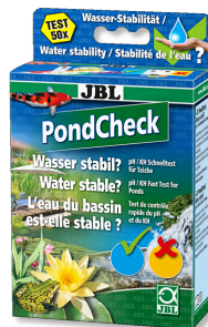
JBL PondCheck Quick test to determine the pH and KH values