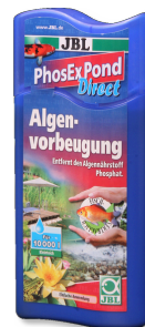
JBL PhosEX Pond Direct Phosphate remover for ponds