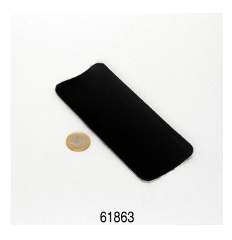
JBL Floaty Pad