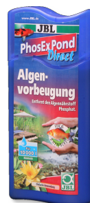
JBL PhosEX Pond Direct Phosphate remover for ponds