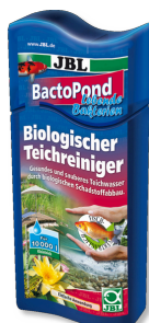
JBL BactoPond Bacteria for biological purification of the pond