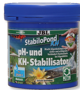
JBL StabiloPond KH pH balancer for garden ponds