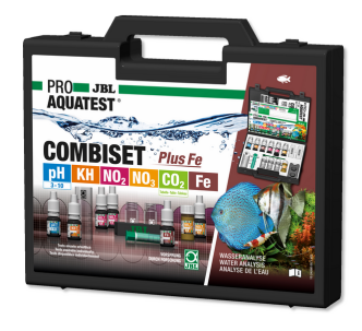
JBL PROAQUATEST COMBISET Plus Fe Test case with most important water tests + iron test