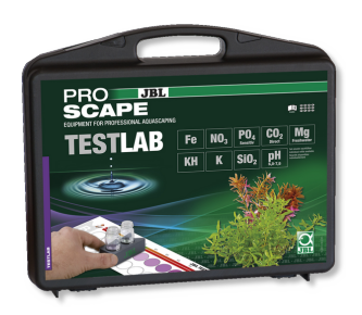
JBL Testlab ProScape Test case for water analysis in plant aquariums