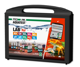
JBL PROAQUATEST LAB Koi

Professional test case for marine water analysis