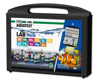
JBL PROAQUATEST LAB Marin

Professional test case for marine water analysis